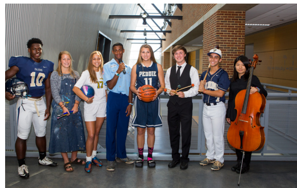
Peddie School provides support for a full range of charitable gift planning options and services. Peddie School, its employees or representatives, do not offer legal or financial advice.

YOU'VE WORKED HARD TO ACHIEVE WHAT YOU HAVE. A WILL GIVES YOU THE CONTROL YOU DESERVE TO SAY WHAT HAPPENS TO IT.